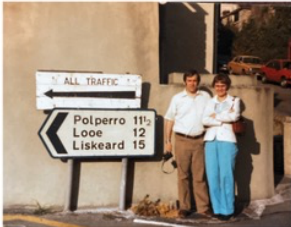
June 1, 1984 - Our 10th Anniversary